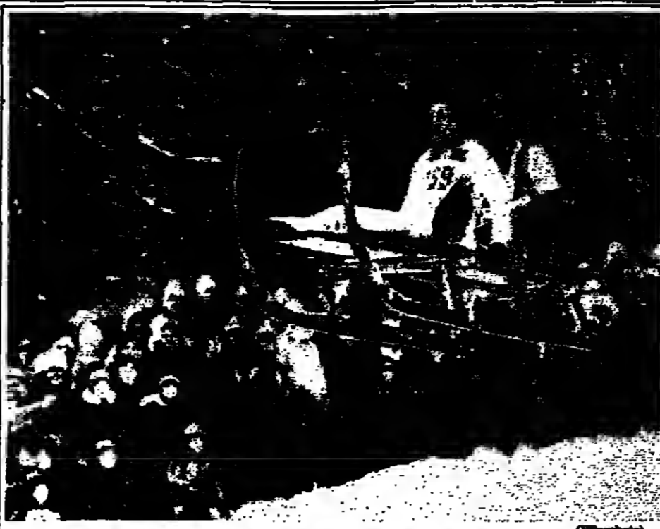
AIRBORNE: Bavarian highlanders enjoying themselves in the annual hay sledge race at Gaisbach recently. The farmers usually use the sledge to carry hay from the Alpine pastures to their stables.